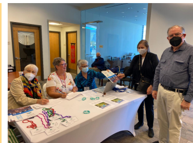
Registration site served as gateway to tour