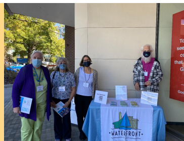
Welcome table at Saint Augustine's Church